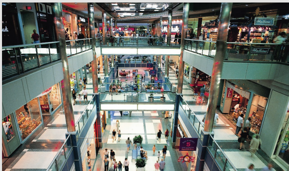
Mall of America is among many Twin Cities hot spots to upgrade to DAS technology.

In today's social media driven world, everyone has a platform to share their in-the-moment experience. And, with the millions of visitors set to visit the Twin Cities over the next few years for Superbowl LII in February, the NCAA Men's Final Four Championship in 2019, and a growing amount of concerts and special guests, the need for reliable cell phone service from carriers is vital.