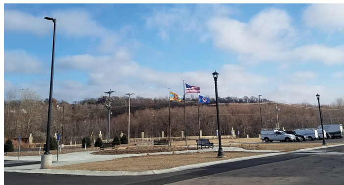
The upgraded Holman Field Airport features new light poles and fixtures, taxiway lights, and flag poles.

The Twin Cities and its local airports are now safer, brighter, and ready for some football.