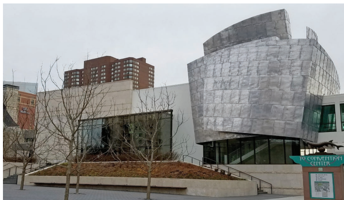
Picture above is for placement only. The new Open Doors Open Future building will be ready just in time for 2017 Christmas services

Services Provided: exterior and interior LED lighting, lighting control and distribution system, mechanical equipment wiring, general purpose power wiring, audiovisual conduit system ■