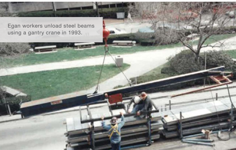
Egan workers unload steel beams using a gantry crane in 1993.