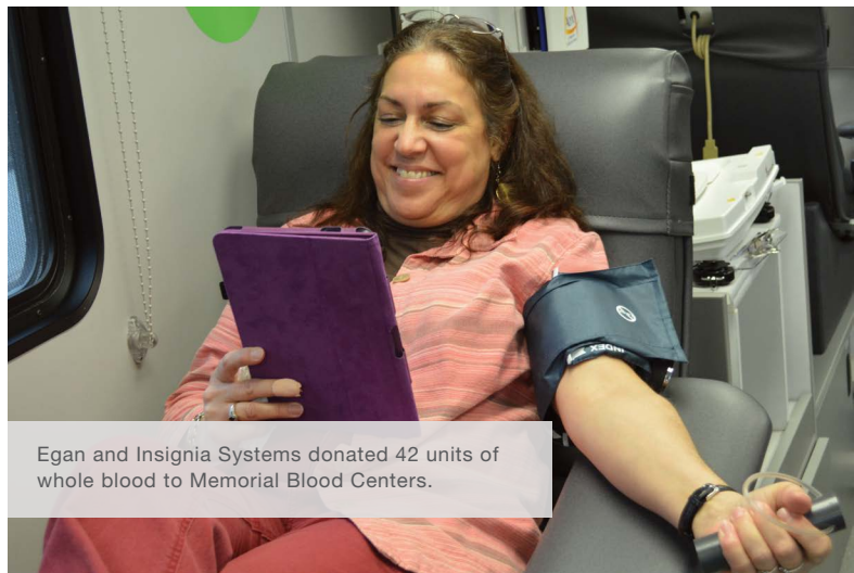
Egan and Insignia Systems donated 42 units of whole blood to Memorial Blood Centers.