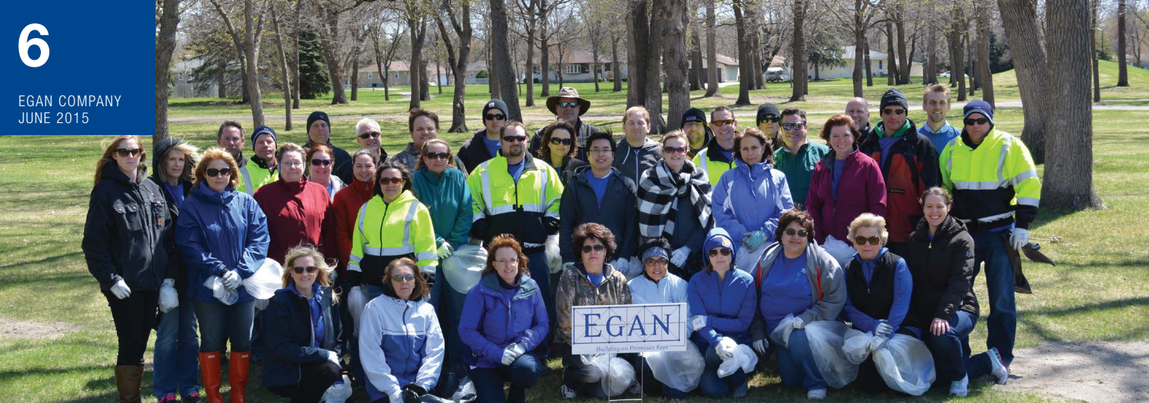
Egan employees cleaned up Hartkopf Park in Brooklyn Park, Minn. and donated blood this Spring.